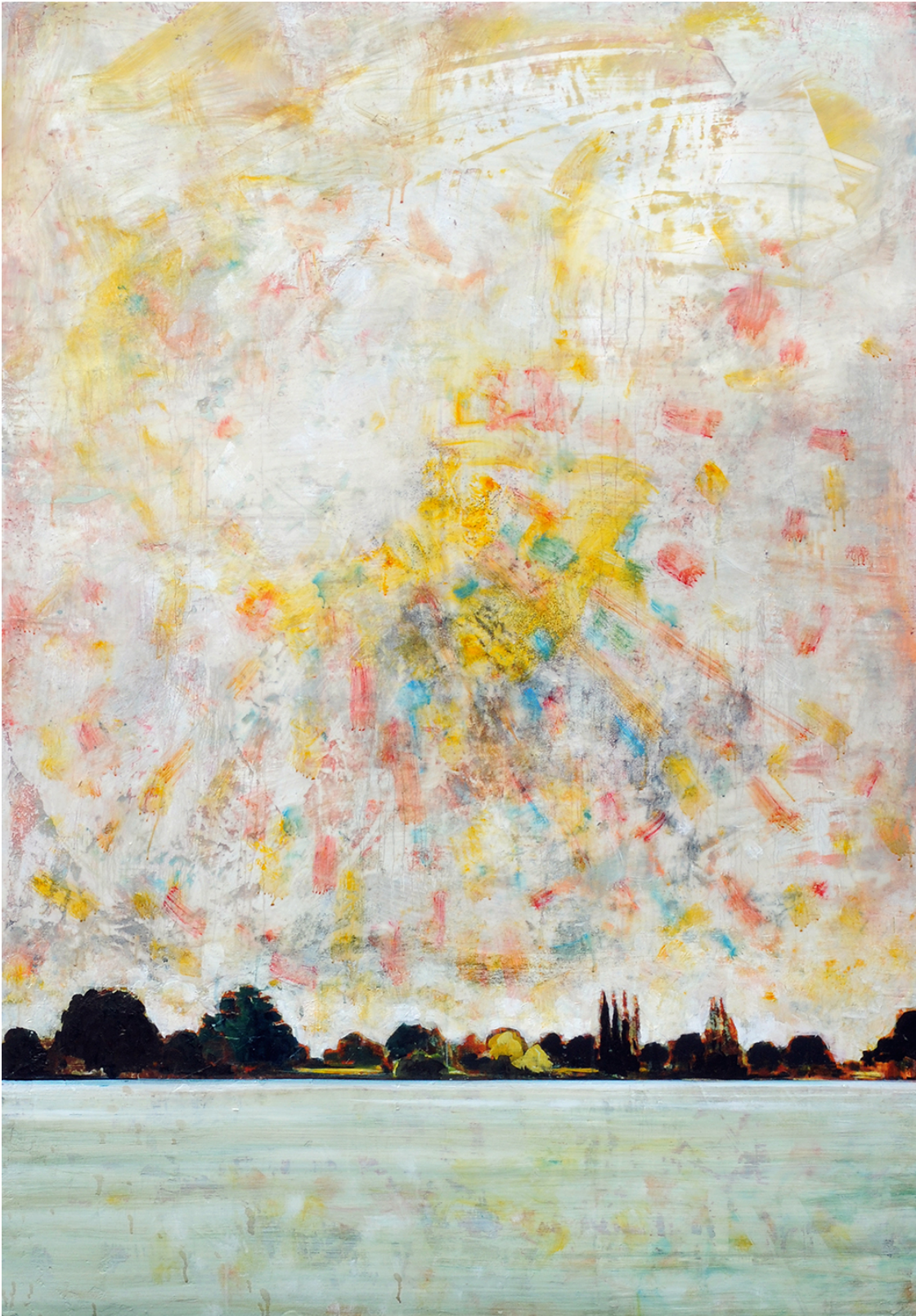
Flooded Land III , 2018 Oil on plywood and gesso 152.5 x 108 cm