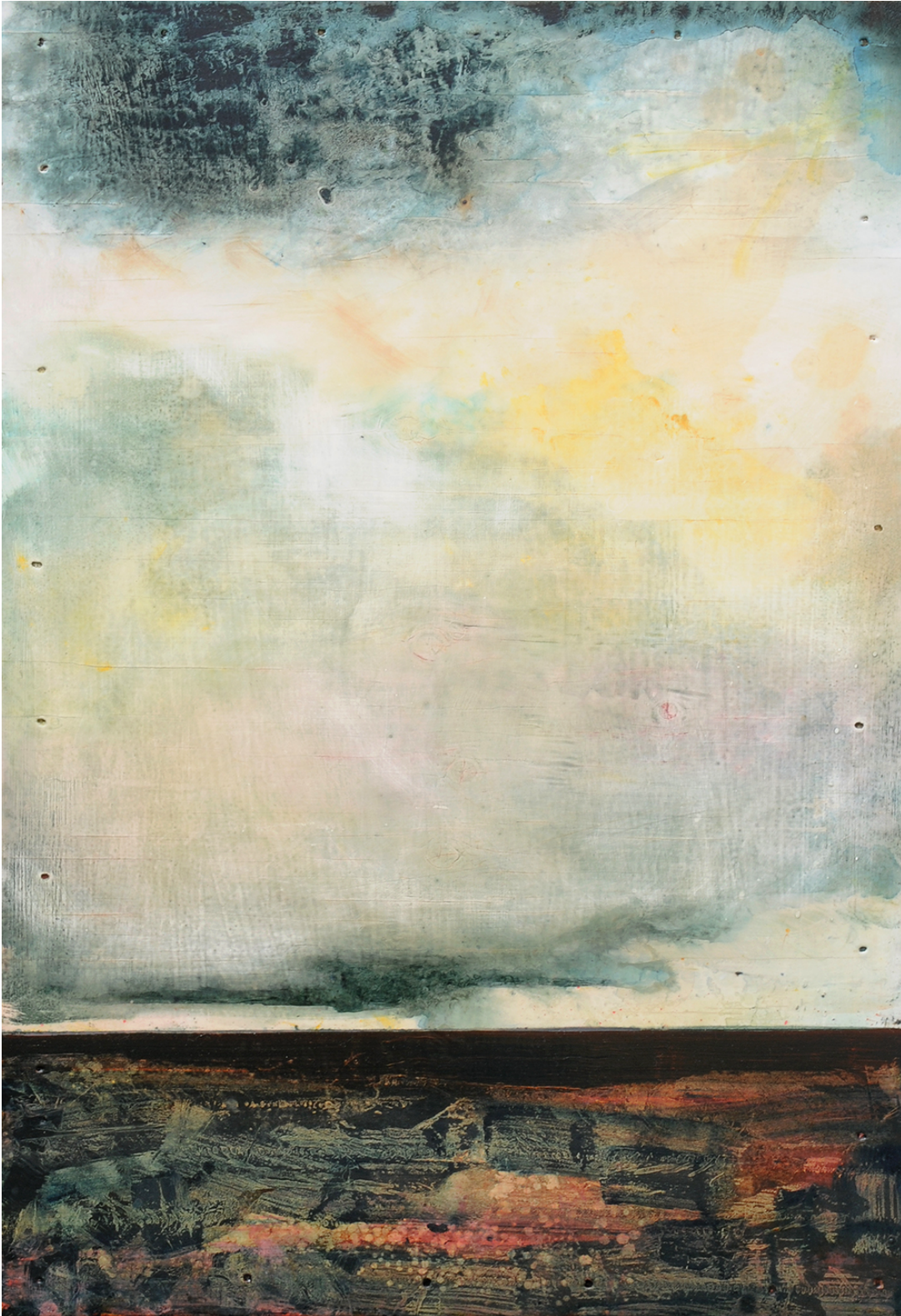
Storm Horizon , 2018 Oil on plywood and gesso 99 x 61 cm