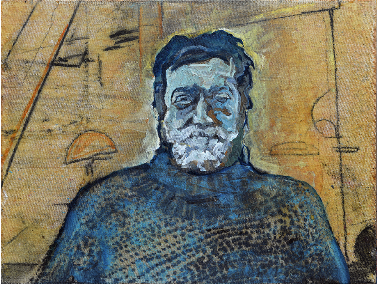
Explorer (Sir Ernest Shackleton) , 2011 Oil and encaustic on cotton covered board 61 x 81 cm