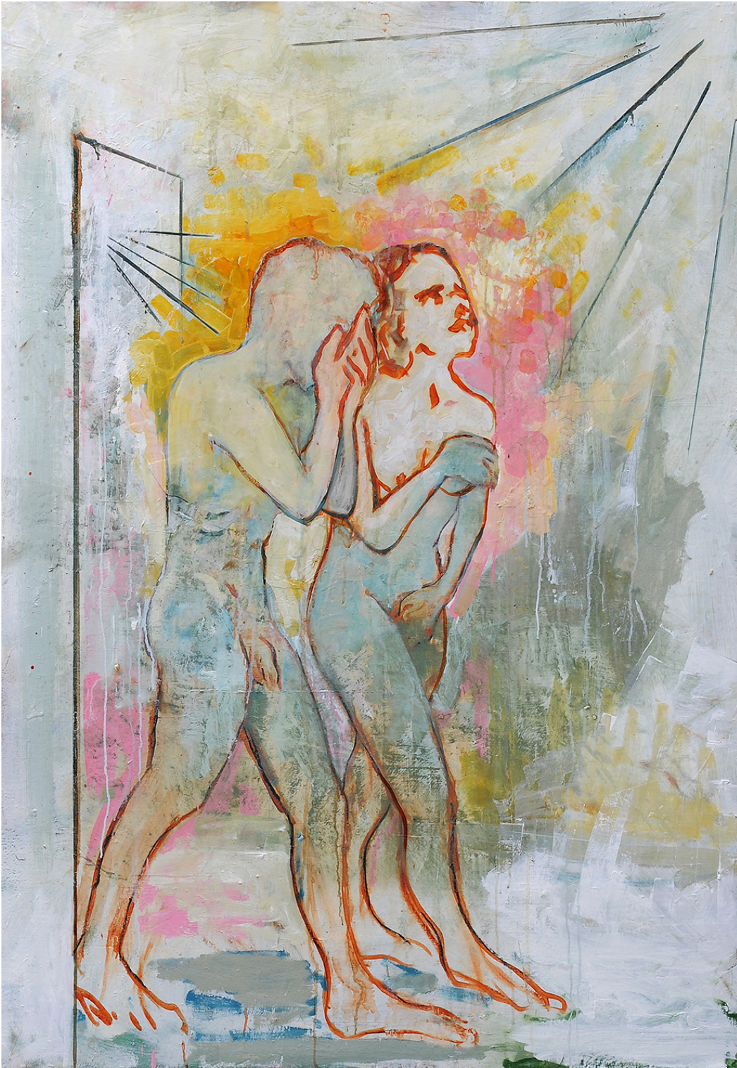
Our Expulsion (after Masaccio) , 2015

Oil, charcoal and beeswax encaustic on cotton covered board 152.5 x 107 cm