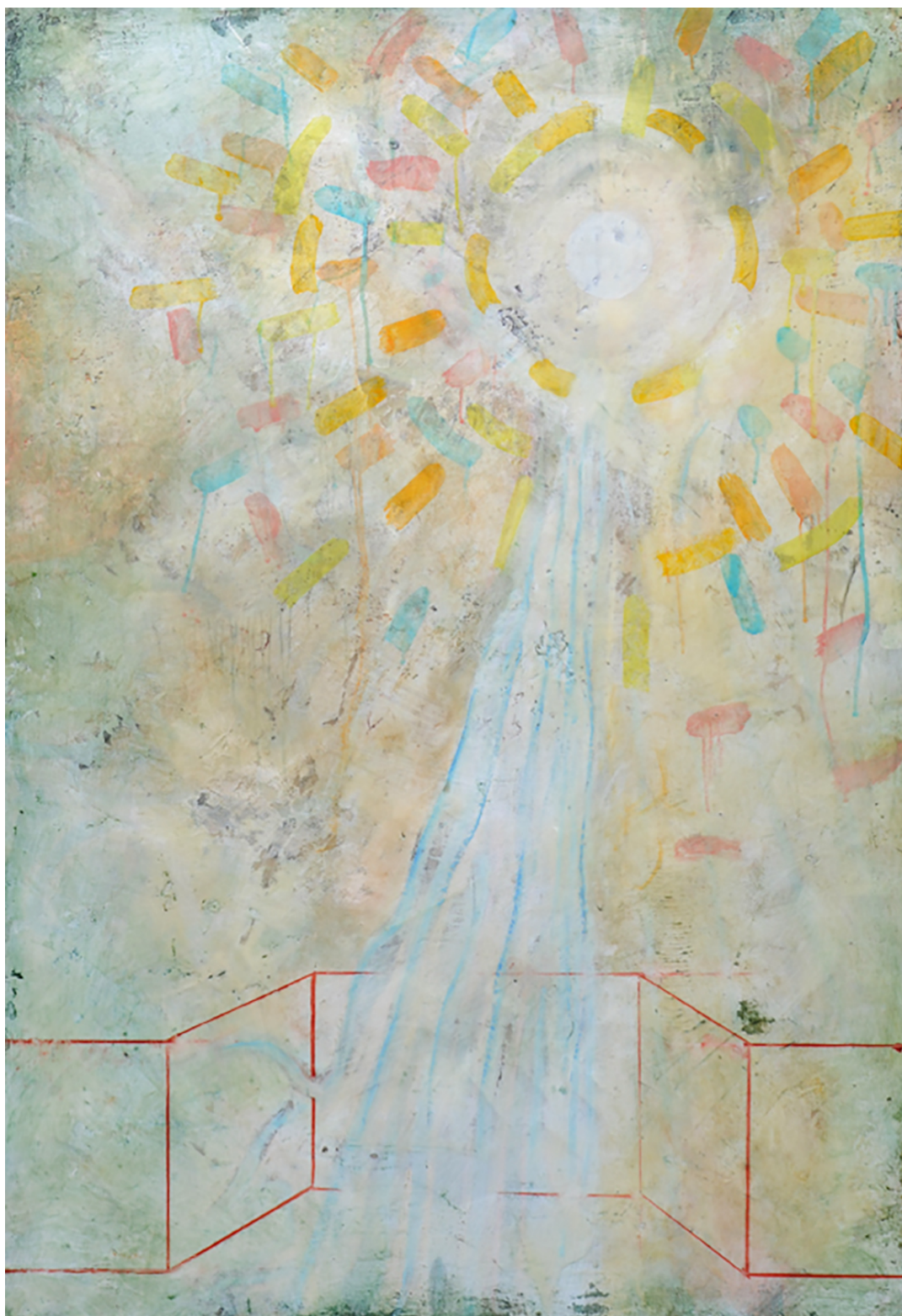
Water Springs Eternal from the Impossible Garden of Light , 2016 Oil, charcoal and beeswax encaustic on cotton covered board 152.5 x 107 cm