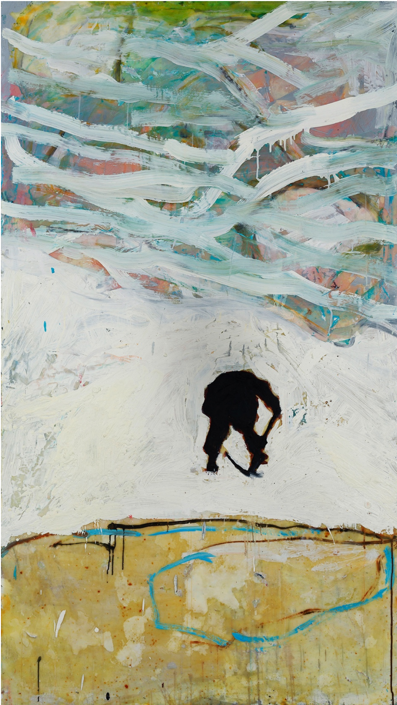
Man Breaking Ice, 2012

Oil and encaustic on cotton covered plywood 200 x 112 cm