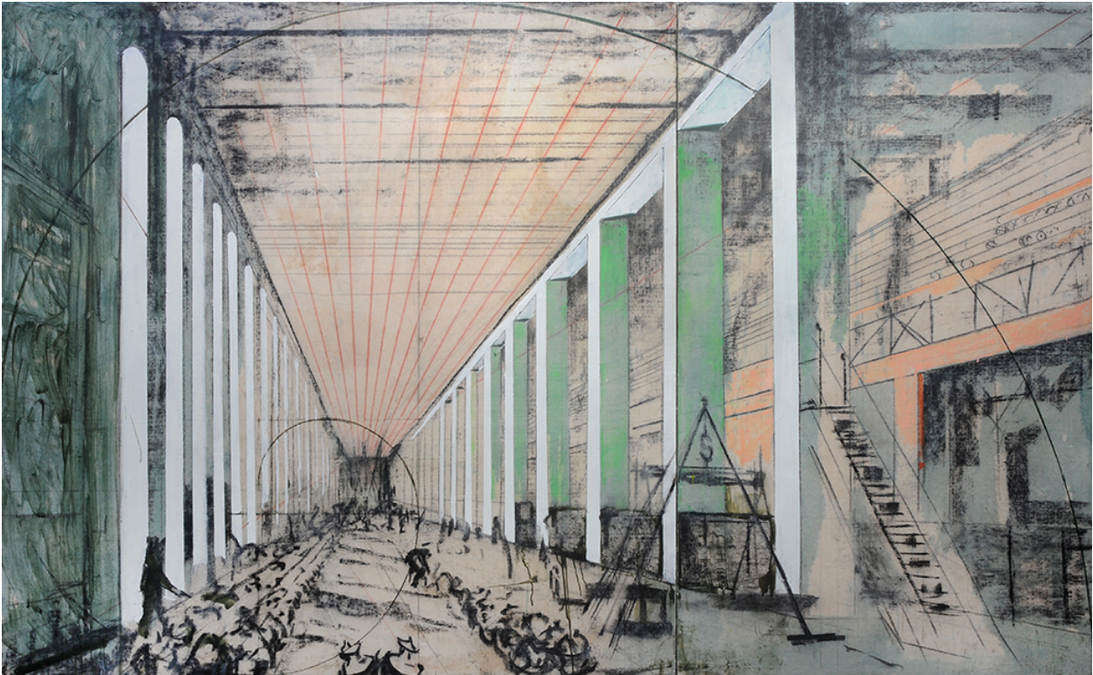
Opium Factory and Golden Section, 2014

Oil and beeswax encaustic on cotton covered plywood 183 x 296 cm