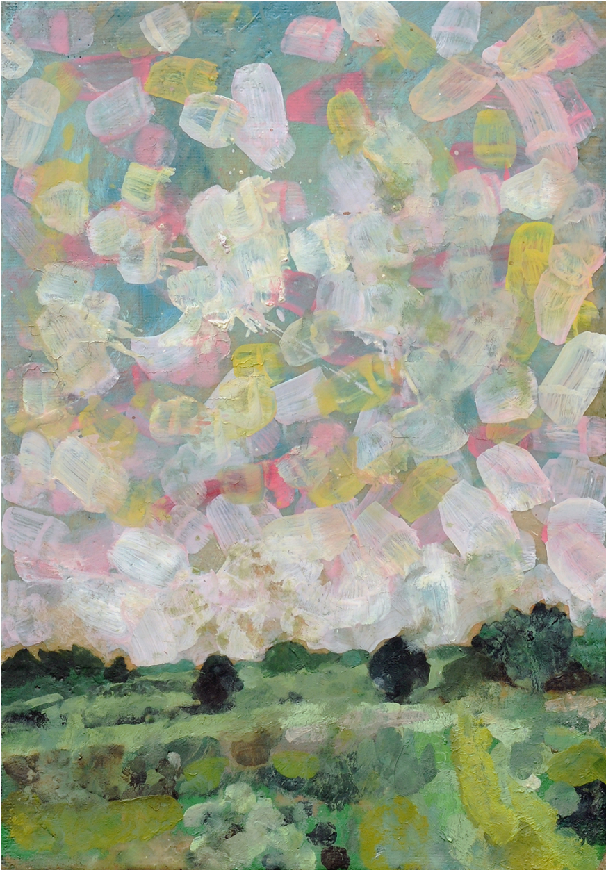
Skyscape, 2016 Oil and encaustic on cotton covered plywood 50.5 x 35.5 cm