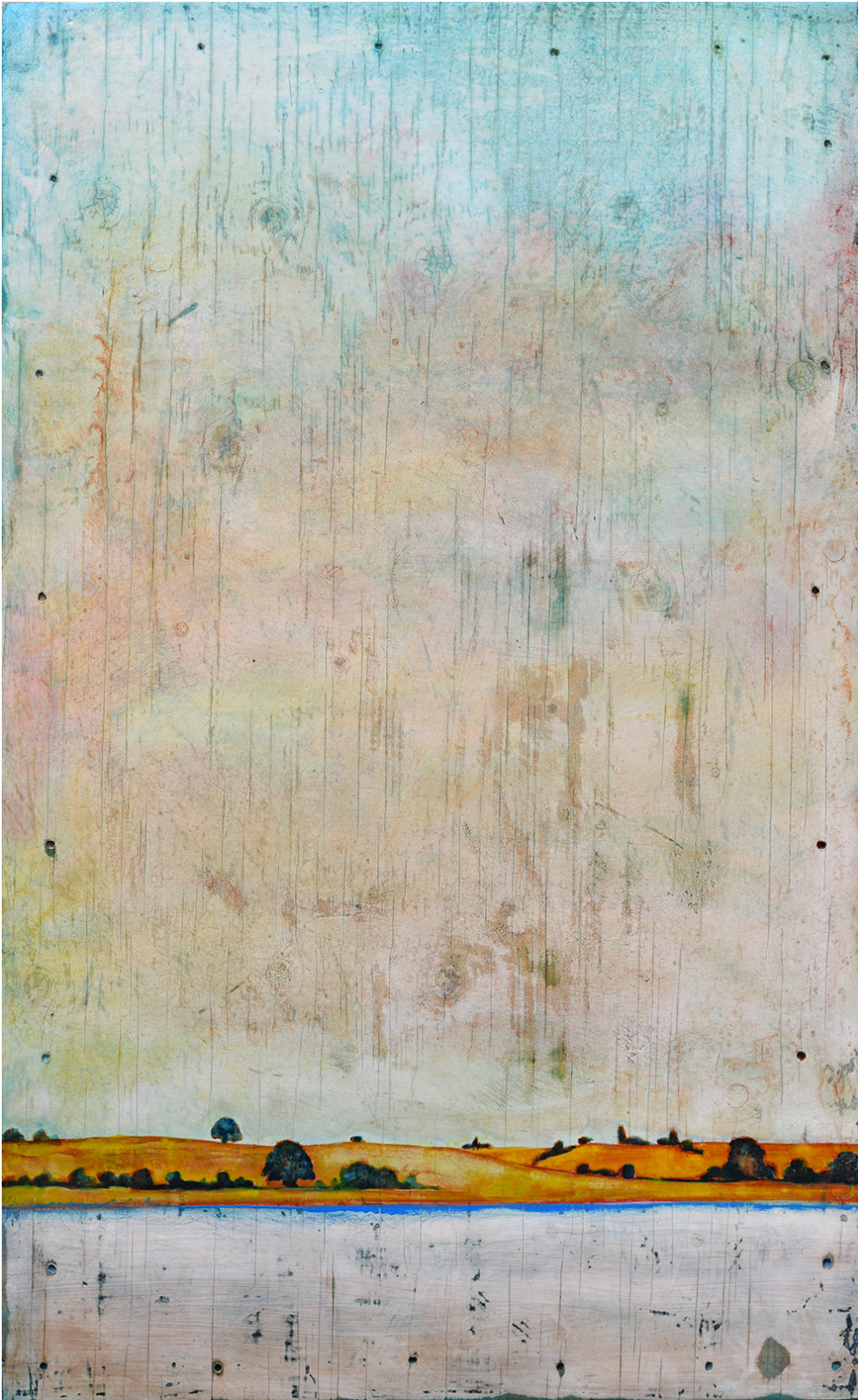
Golden Fields of the North Lands, 2020