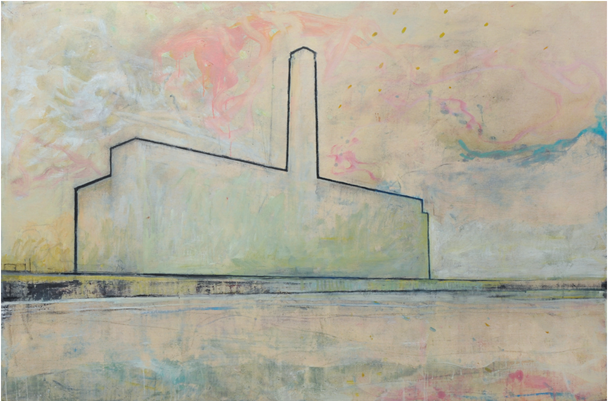
Study for a Power Station, 2013 Oil and encaustic on cotton covered plywood 122 x 183 cm £6,000 + VAT