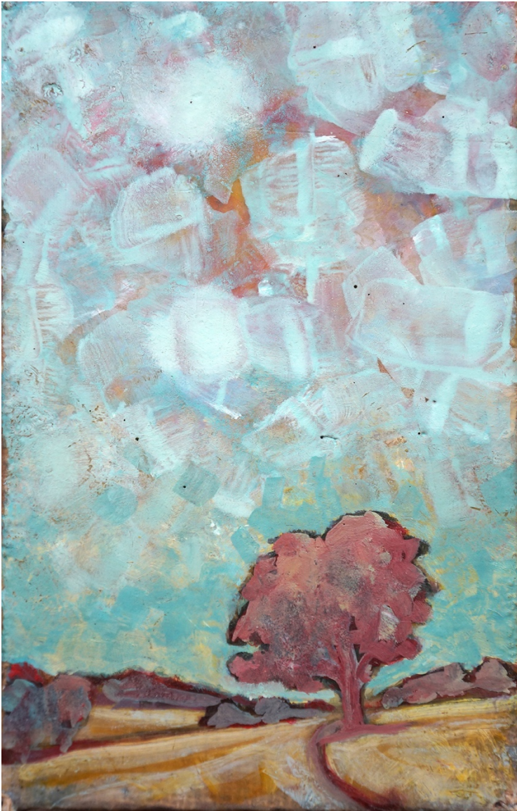
A Study for the Path to the Mighty Oak , 2016 Oil and encaustic on hessian covered plywood Series painting No. 12 of 20 similar works. 22 x 14 cm