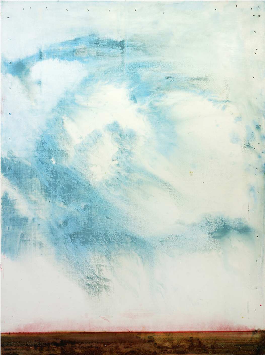
Blue Clouds, Red Horizon, 2018