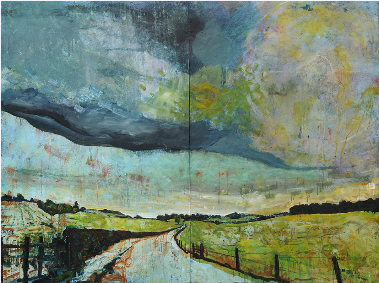
Mock Sun: Down the Road, Past the Fields Under the Dark Cloud and into the Woods, 2014 Oil and encaustic on cotton covered plywood 183 x 244 cm in two panels joined in the middle