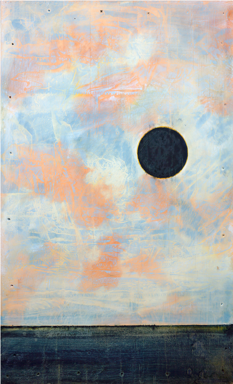
Black Sun, 2019 Oil on gesso and plywood 99 x 61 cm