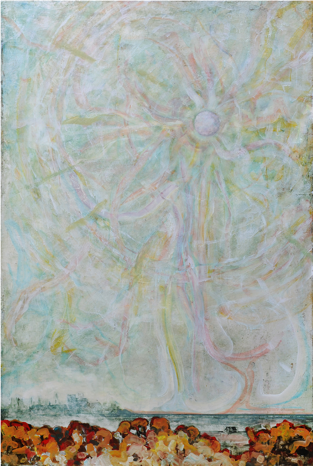
Sun Above the Power Station and Lifeboat House, 2016 Oil and beeswax encaustic on cotton covered plywood 183 x 122 cm